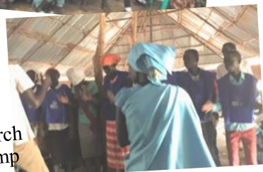
Inside the church in refugee camp