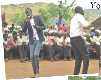
Youth conference in refugee camp