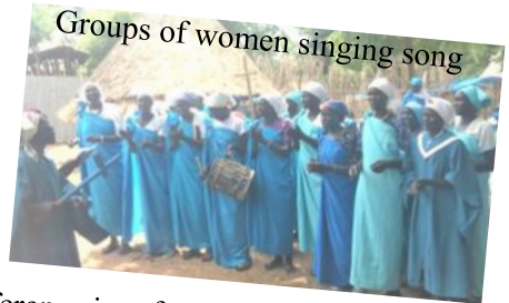
Groups of women singing song