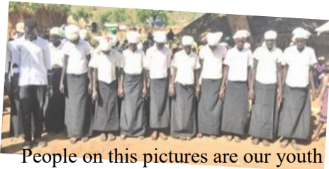
People on this pictures are our youth