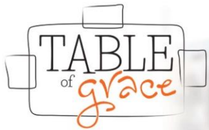
TABLE OF GRACE

NESAP continues to need plastic grocery bags and brown paper grocery bags. These bags can also be dropped off in the Narthex or education building, where the donation baskets are.